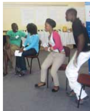
Peer Educators using performing arts to get the message across