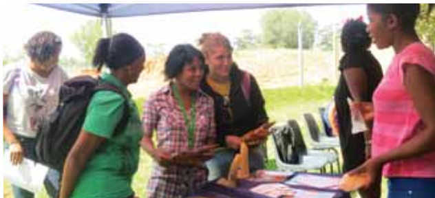
Peer Educators promote the Abstinence Club and provide information to participants

The HIV/AIDS Unit wishes to apologise for the delay in providing incentives to the staff and students concerned. Those who still have not received theirs are encouraged to collect it from the HIV/AIDS Unit office at their respective campuses or the Mobile Wellness Unit.