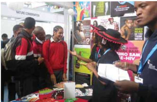
Peer Educators educating many learners that flocked to the HIV/AIDS Unit stand