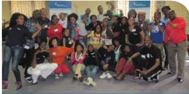
Peer Educators furthering their training at the Western Cape College of Nursing

'I respect these people and they are amazing to work with'