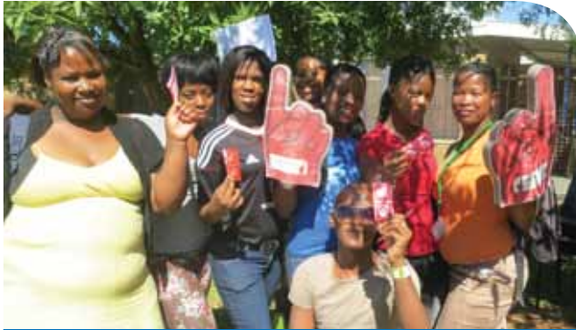
“First Things First” campaign is being introduced on all campuses at CPUT

entire process, “It is safe, quick and hygienic”, he added.