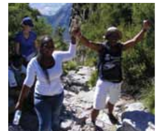
Triumph near the top